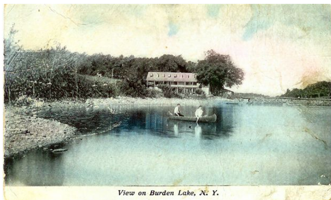
View on Burden Lake, N. Y.